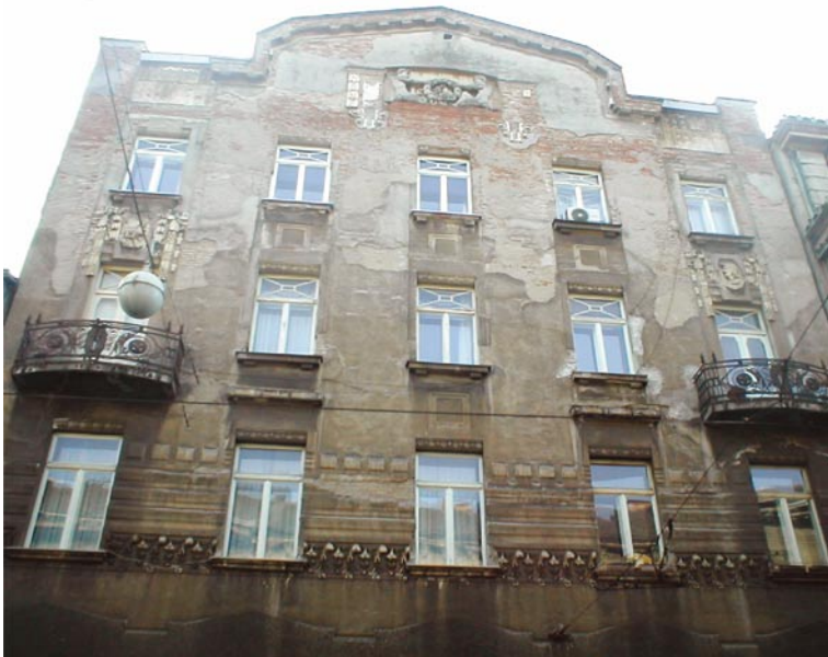
Dilapidated condition of old buildings